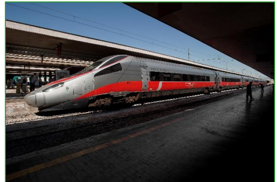
Figure 8: Trenitalia Train Exterior