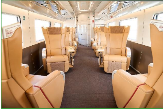
Figure 5: Executive Class Seating, Trenitalia