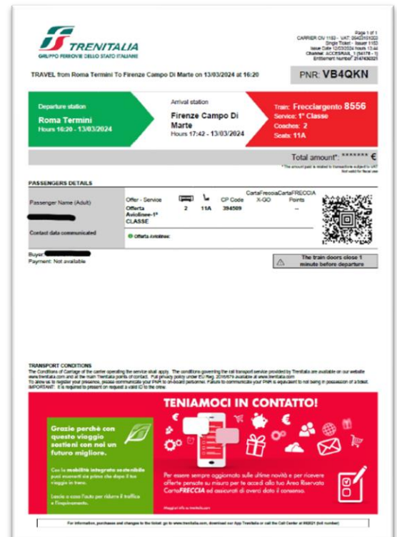
Figure 9: Trenitalia Train Ticket Example

Passengers who arrive at Fiumicino Airport or Malpensa Airport will receive two tickets and a Second page, instructions on how to take the express service, when they check-in. The red section at the top of the ticket indicates if it is the airport express train, or if it is a Freccioargento or Freccirossa train.