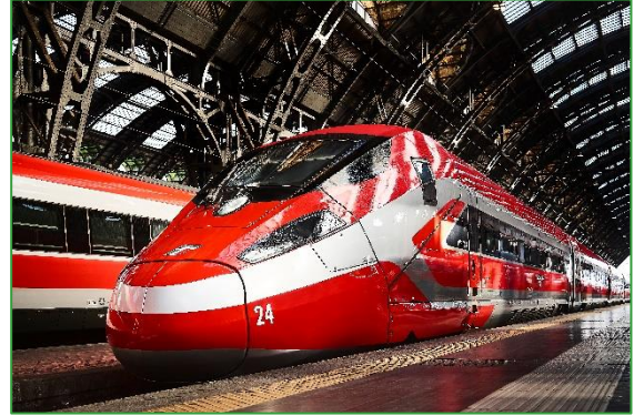
Figure 6: Trenitalia Frecciarossa Train