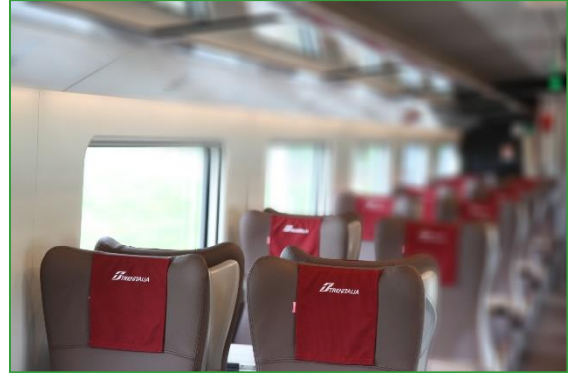
Figure 2: Premium Class Seating, Trenitalia