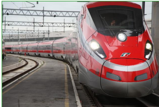
Figure 7: Trenitalia Train Exterior