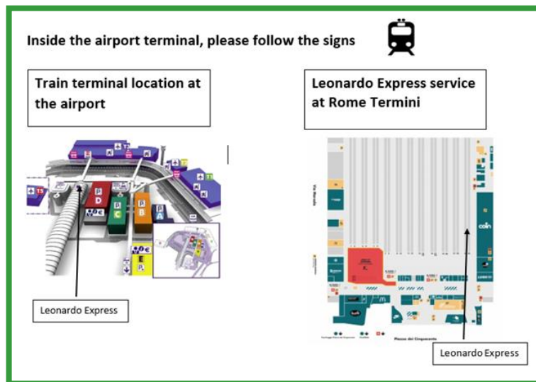
Figure 12: Leonardo Express Stations

Passengers who arrive at Fiumicino Airport in Rome will receive a ticket for the Leonardo Express (Figure 10). The Leonardo Express is an express service between Fiumicino Airport and Roma Termini. Passengers can follow the blue signs in the Airport which will lead them to the Leonardo Express train terminal. The Leonardo Express departs every 15 minutes and takes 32 minutes to reach Roma Termini from Fiumicino Airport.