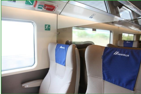
Figure 1: Business Class Seating, Trenitalia