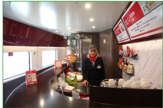
Figure 4: Dining Car, Trenitalia