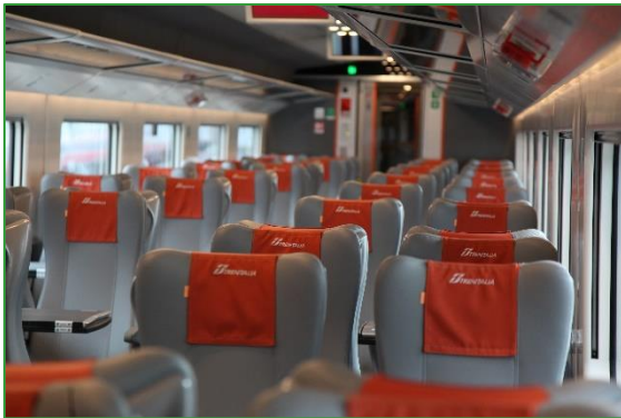
Figure 3: Standard Class Seating, Trenitalia