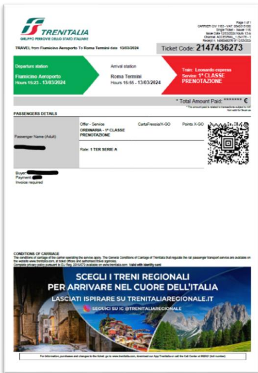
Figure 10: Airport Express Ticket Example

Passengers must check-in to retrieve their actual travel documents (Figure 9). Check-in can be done beginning 72-hours prior to departure. Check-in is done on https://check-in.accesrail.com/#/step1 (Figure 11) using the passenger's name as it appears in the booking and either the booking reference or 13-digit ticket number.