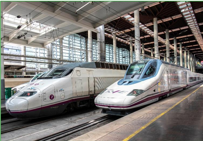
Figure 3: Renfe Train Exterior