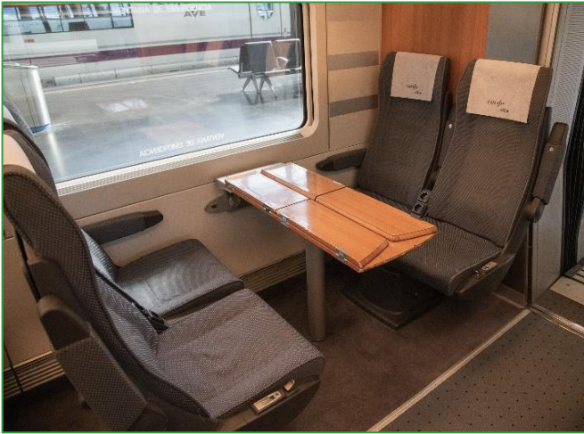
Figure 1: Elige Class Seating, Renfe