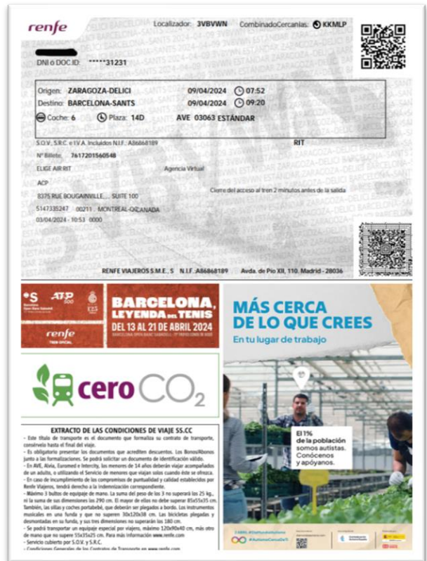
Figure 5: Renfe Train Ticket Example