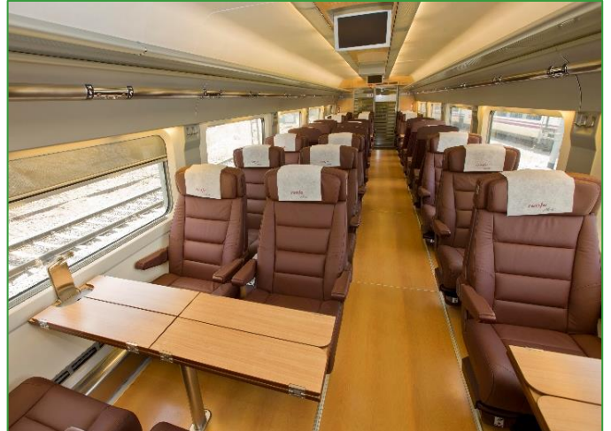
Figure 2: Premium Class Seating, Renfe