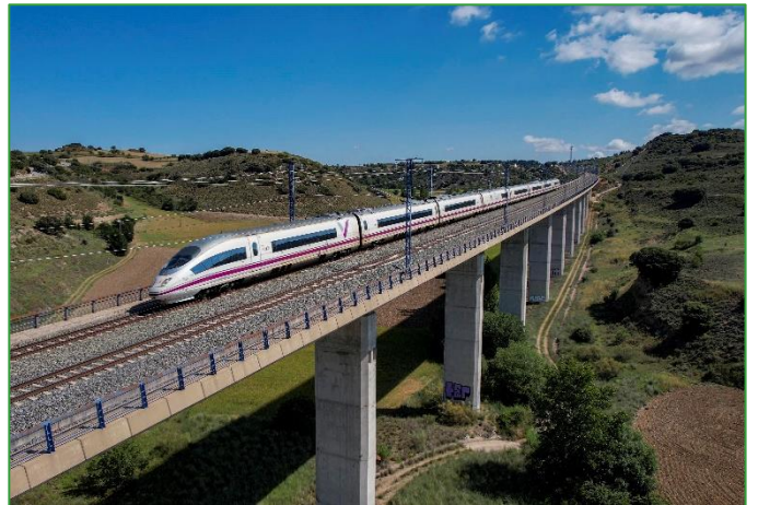
Figure 4: Renfe Train Exterior