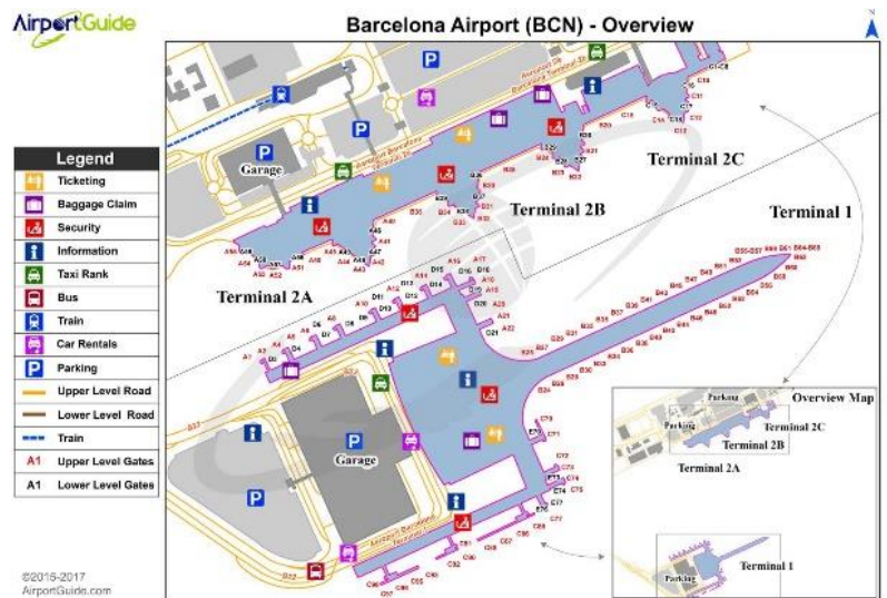
Figure 8: Map of Barcelona Airport

To/From Barcelona Airport: From Barcelona Airport customers can take the R2 Nord Line just outside Terminal 2 to Barcelona Sants Train Station by following the signage to the train. Travel time is approximately 20 minutes. If customers arrive in Terminal 1, they can take the free airport shuttle to Terminal 2; travel time is approximately 10 minutes between the terminals. The R2 Nord Line connects BCN Airport to the city of Barcelona. With a 30-minute