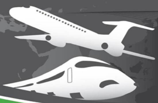
Figure 6: Check-in Page